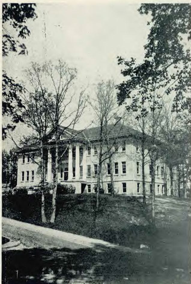
Approaching Columbia Hall from the Sligo bridge.