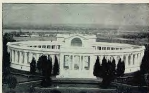
The Amphitheatre at Arlington. Directly in front is the tomb of the unknown soldier.