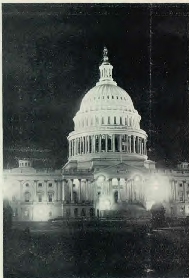
The National Capitol by night