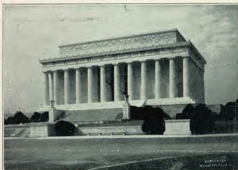
The Lincoln Memorial in Washington.