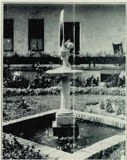
The fountain and flower garden in front of the Hospital across the campus