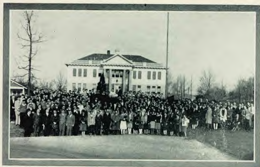
Last year's student body, with College Hall in the back ground.