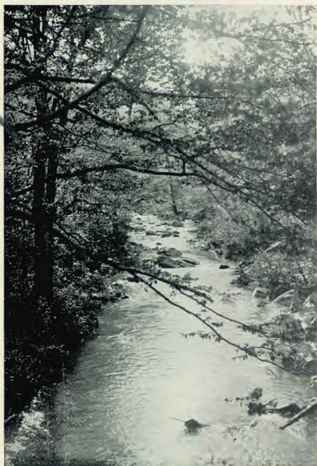
The Sligo Creek, from which THE SLIGONIAN received its name.