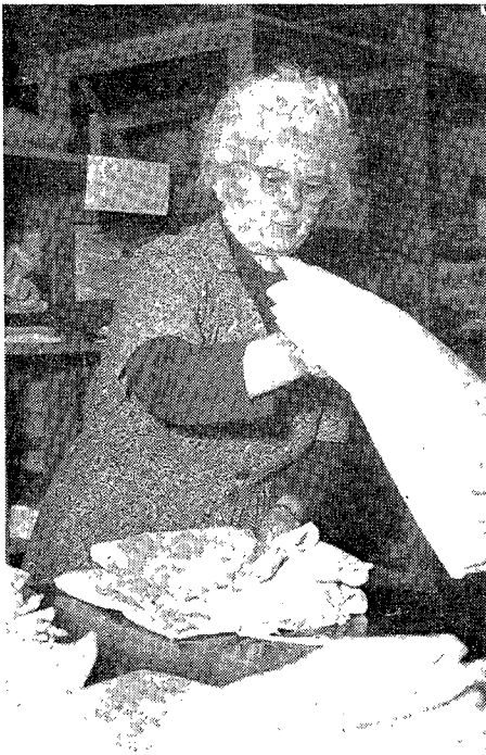
Dorcias helpers at work in the new Hamburg warehouse.