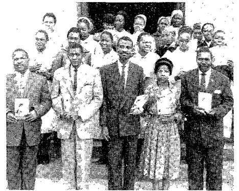
Ingatherers at Maluti Hospital, Basutoland.

Now, the 1965 Ingathering crusade is before us. This year I believe we can reach £125,000 if everyone of us does his or her part! Of course it is a high goal. Of course, it will not be easy to reach. Of course, there will be difficulties. Of course, many people will say it cannot be done. But in spite of it all— Trans-Africa Can! Trans-Africa Will! —come through with the most successful Ingathering crusade in its history. More members will pray. More members will work. More members will do more than ever before. God will do His part. He will bless. He will speak to the