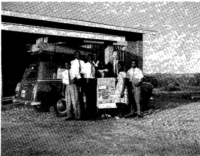
Branch Sabbath-school officers setting out from Bugema Missionary College, Uganda.

Most of the teachers left as well to enjoy holidays after a busy year.