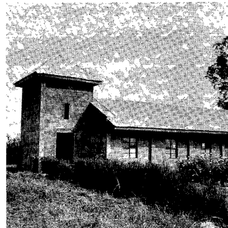
The new Manyata church in the Ranen Field.