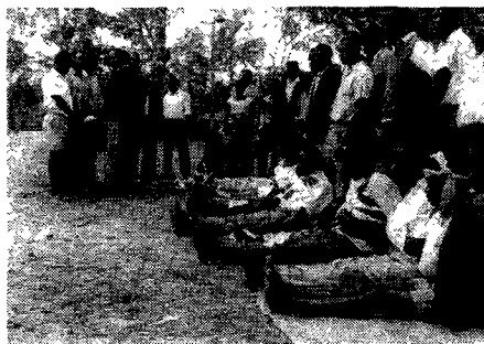
First Aid After Make-Believe Bus Accident.

The results of such a concentrated course have been noted in an increase of spiritual activities among the 5,000 youth of the South-East Africa Union.