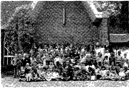
Vacation Bible School in Nairobi, Kenya.