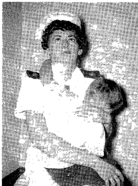
Somebody's little boy has been struck by a drunken driver. It could have been yours.