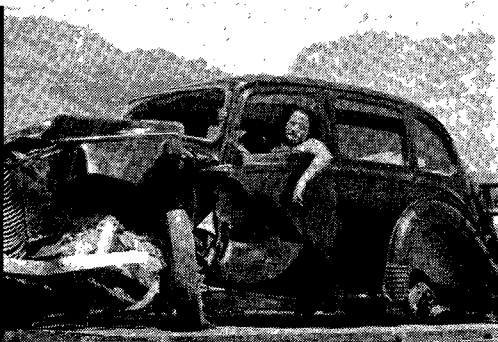
YES, you've seen this picture before. Take a second look at it. Temperance and Intemperance IS your business.