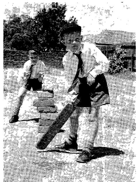
Let us help our children guard their wickets. We have precious lives to protect.