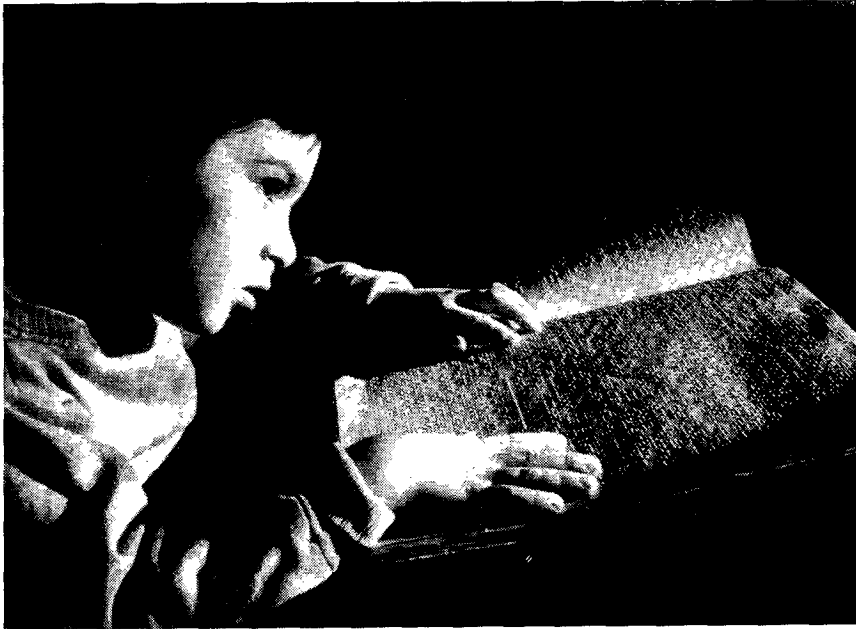
"Light" for blinded eyes.