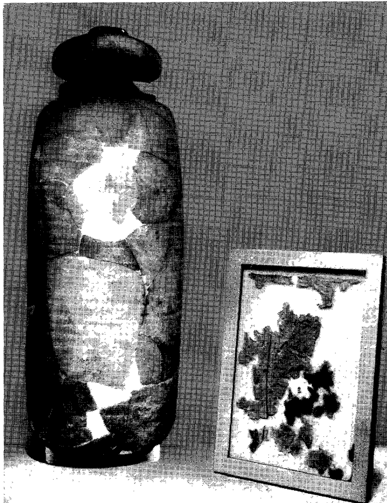
Dead Sea scroll jar. Jars such as the one pictured here were especially made in antiquity as storage containers for scrolls stored in caves. The scrolls were wrapped in linen before being placed in the jars. The Dead Sea scrolls and many jars are now housed in the Shrine of the Book in Jerusalem.