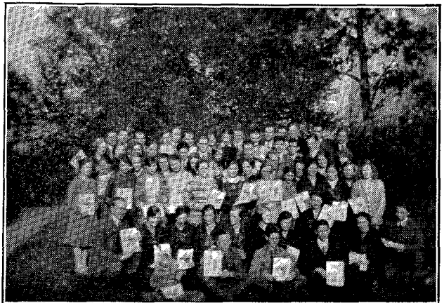
Those who took part in the Harvest Ingathering work.