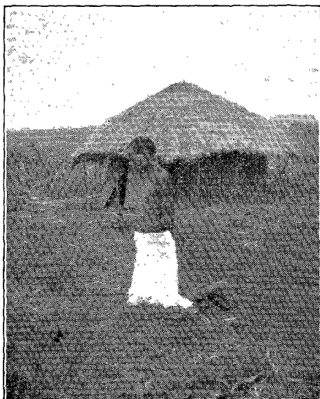
A Utimbaru convert at worship.