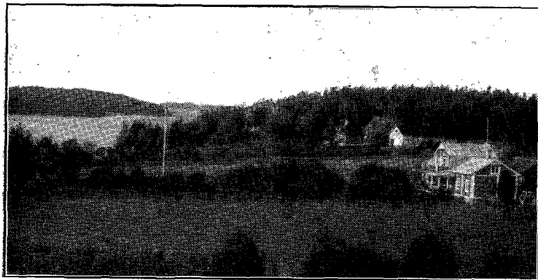
Toivonlinna Mission School and Summer Sanitarium, Finland.