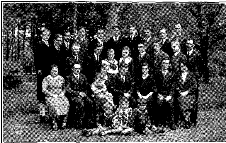
Faculty and students of the Polish Mission School.