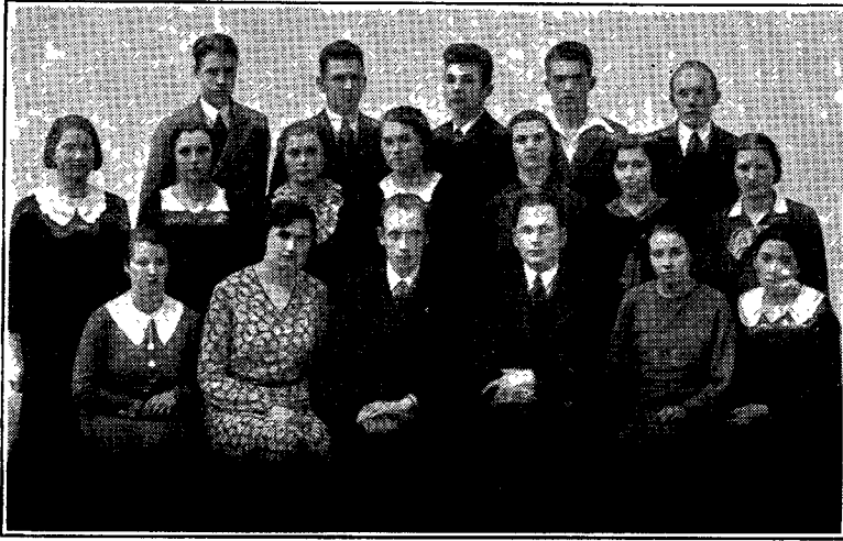
Faculty and students of the Estonian Mission School.