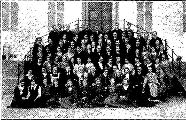
Faculty and students at Ekebyholm Mission School.