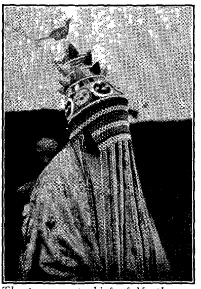
The paramount chief of North-west Nigeria wearing his elaborate headdress of beads.

It was in 1923 that the decision was made to open up work among the Ibo tribe of south-eastern