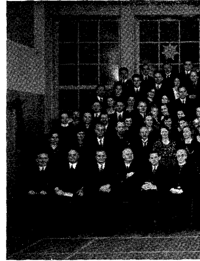
Leaders of our sixty health institution convention at Skodsborg Sanitarium.

During the past ten years we have sent out from our educational