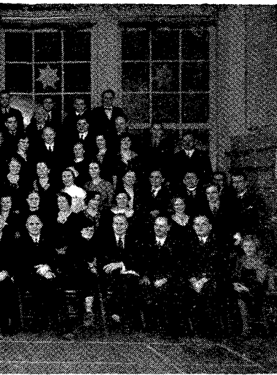
Nordic Union who attended the health conference, December 31, 1936 to January 3, 1937.

done in these northern countries, but we look forward to still greater things. Our greatest need is to lift the spiritual life of the churches, but we find ourselves somewhat handicapped, as so few of them have their own meeting places. Over 100 churches have to rent a hall at a comparatively high cost for their Sabbath meetings, and often cannot afford to rent them for any services during the week. Where, then, can they have their prayer meetings, Missionary Volunteer meetings, Dorcas societies, etc.? These are of great importance to spiritual life. The churches are doing their best to collect funds, but we cannot get enough to build. However, we are of good courage and press forward, hoping soon to reach the promised land.