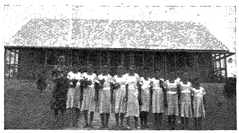
Students at the Aba Girls' School, in South-Eastern Nigeria.

wanted to be Christians and join our church were beaten thirty to forty times on their backs and given only half their usual food. One was chained and locked in a room for coming to the Sabbath-school, but all stood firm. There are now 112 Sabbath-school members and thirty-nine in the baptismal class, and some ready for baptism. Not long before, a number of these people were cannibals.