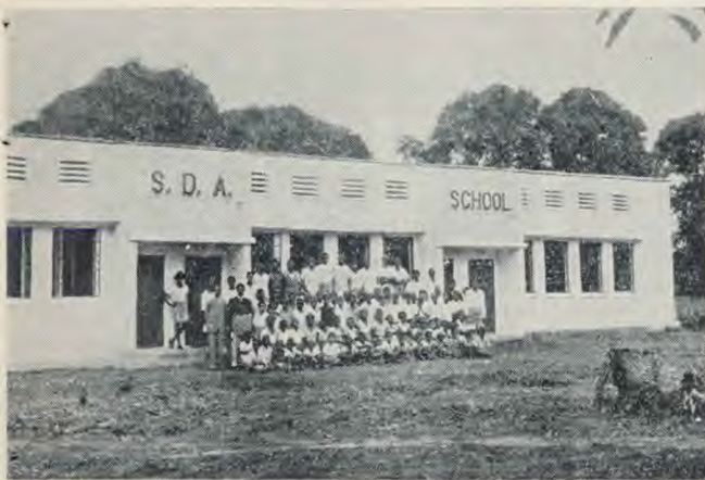
The fine modern school building at Yele, Sierra Leone. This school has a bright and secure future.

that matter over our work in the whole chiefdom of which Yele is the headquarters. A mighty duel was being fought between the Roman Catholic Mission and our own. A strong effort continued to be made to dispossess us. Today the struggle is largely ended. We are in a stronger position today than ever before in this place, and the future of the school in Yele seems reasonably secure.