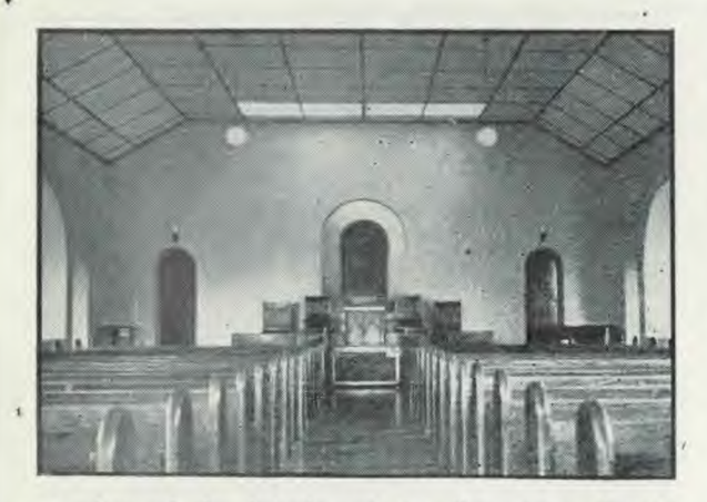
A view of the interior of the fine stone church, recently completed at Ile-Ife, Nigeria.

May each reader join in praying that September 3, 1955 will but mark the beginning of even greater achievements for God in the Ife District and that this House of Prayer will greatly strengthen the spiritual growth and influence of the Seventh-day Adventist Hospital Church, Ile-Ife, Nigeria.