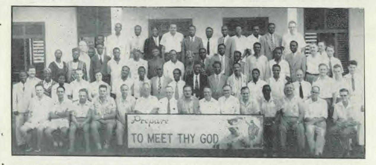
The full group of delegates who assembled at Bekwai, Gold Coast, for the second Constituency Meeting of the West African Union Mission of Seventh-day Adventists.

It was interesting to note that one morning the message was about "Satan's most valuable tool, discouragment." The very next morning the next speaker talked on the subject of "encouragment." The prayer bands