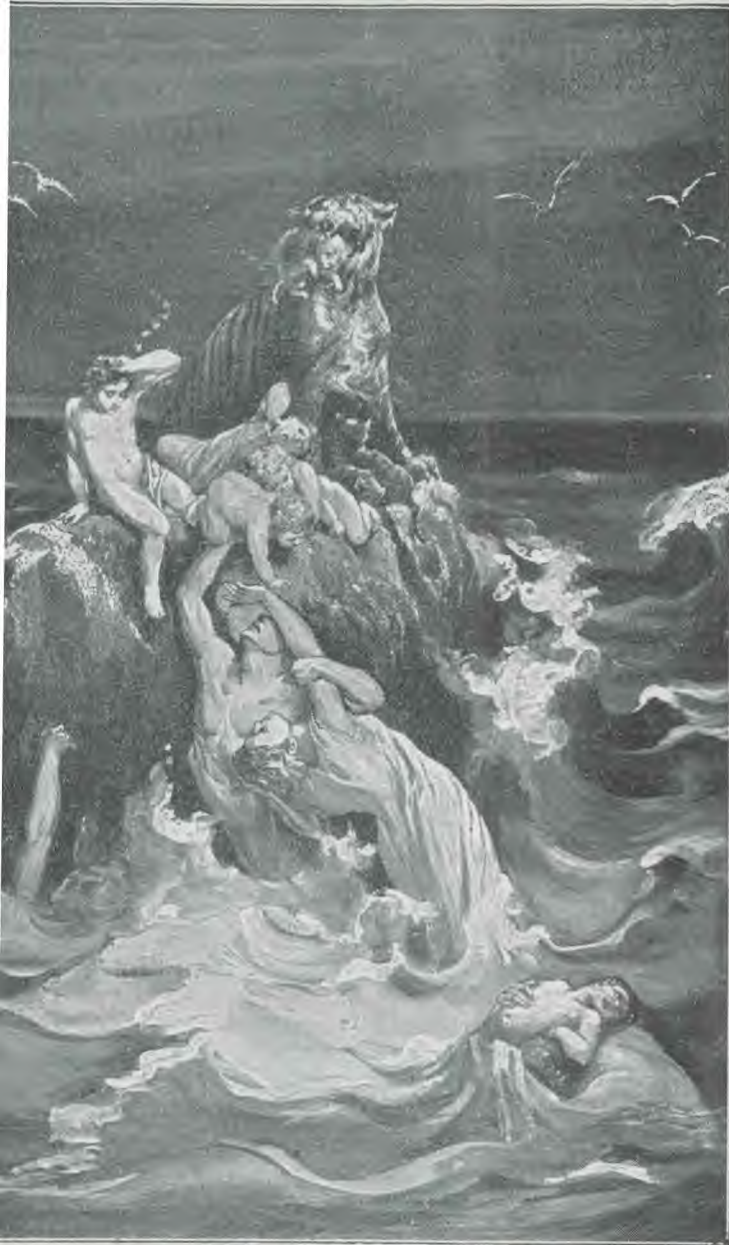
“As in the Days of Noah”

The end of God's mercy is a strange event. His unmingled wrath is terrible to anticipate and impossible to describe adequately in human language. Facing the question, "Who shall be able to stand?" we can only look forward in faith, trusting God for strength to live through these last hours of time, and witnessing to the universe what Christ's righteousness imparted to human flesh can endure.