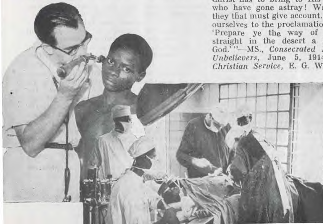
Doctors and nurses consecrate their skill to the physical needs of suffering humanity in West Africa.

"To all who are about to take up special missionary work with the paper prepared for use in the Ingathering campaign, I would say: Be diligent in your efforts; live under the guidance of the Holy Spirit. Add daily to your Christian experience. Let those who have special aptitude for work for unbelievers in the high places as well as in the low places of life. Search diligently for perishing souls. Oh, think of the yearning desire Christ has to bring to His fold again those who have gone astray! Watch for souls as they that must give account. Let us consecrate ourselves to the proclamation of the message. 'Prepare ye the way of the Lord, make straight in the desert a highway for our God.'"—MS., Consecrated Efforts to Reach Unbelievers , June 5, 1914, as quoted in Christian Service , E. G. White, page 169.