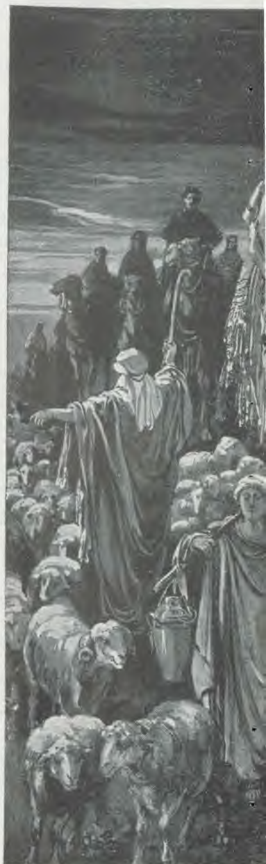
Abraham and Lot's separation

"IF THOU WILT GO TO THE LEFT HAND, THEN I WILL GO TO THE RIGHT"