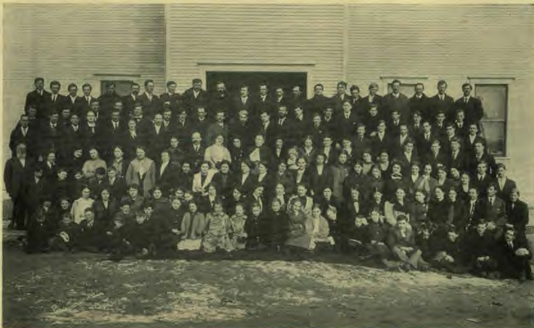
School Board, Teachers and Students, Alberta Academy.

The following from the "Church School Manual" is of interest to every true believer in this message: "Satan has used the most ingenious methods to weave his plans and principles into the systems of education, and thus gain a strong hold on the minds