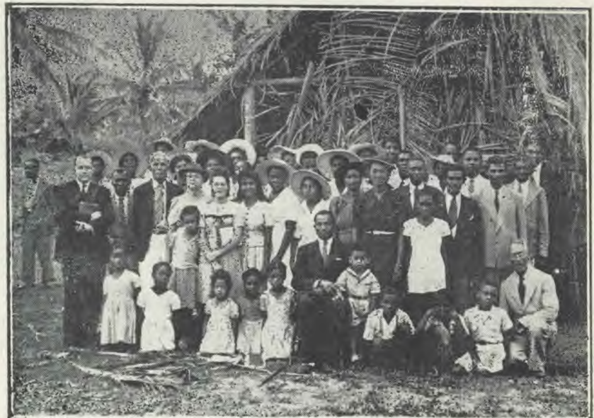
COCKBURN PEN CHURCH ORGANIZED

Recently four tents were purchased from the British Army to be used in country evangelism in different parts of the island of Jamaica. Let us all pray earnestly, brethren and sisters, for the soul-winning work that is going on in different parts of our island field. Let us not forget the prayer circle that meets each Wednesday morning at 8 o'clock. No matter where you may be or what you may be doing, won't you please stop and for a moment offer up a silent or audible prayer to the Lord for the soul-winning work that is going on in different parts of the British West Indies Union? If we will pray unitedly as well as work unitedly, the Lord will certainly add His blessing to our work and a large number of souls will be gathered this year. Remember our goal—2,000 souls baptized—in the British West Indies Union during 1947. If we all do our part, the Lord will certainly reward our efforts and this goal will be more than reached. R. H. P.