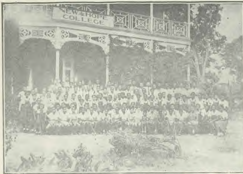
Student Body - New Hope College. This fine school in Kingston has been doing a good work in preparing the young people of Jamaica for service.