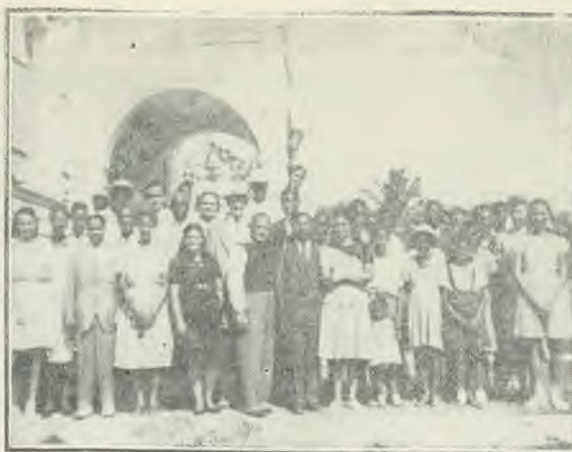
BAHAMAS COLPORTEUR ARMY

"The publishing branch of our cause has much to do with our power. I do desire that it shall accomplish all that the Lord designs it should. If our bookmen do their part faithfully, I know, from the