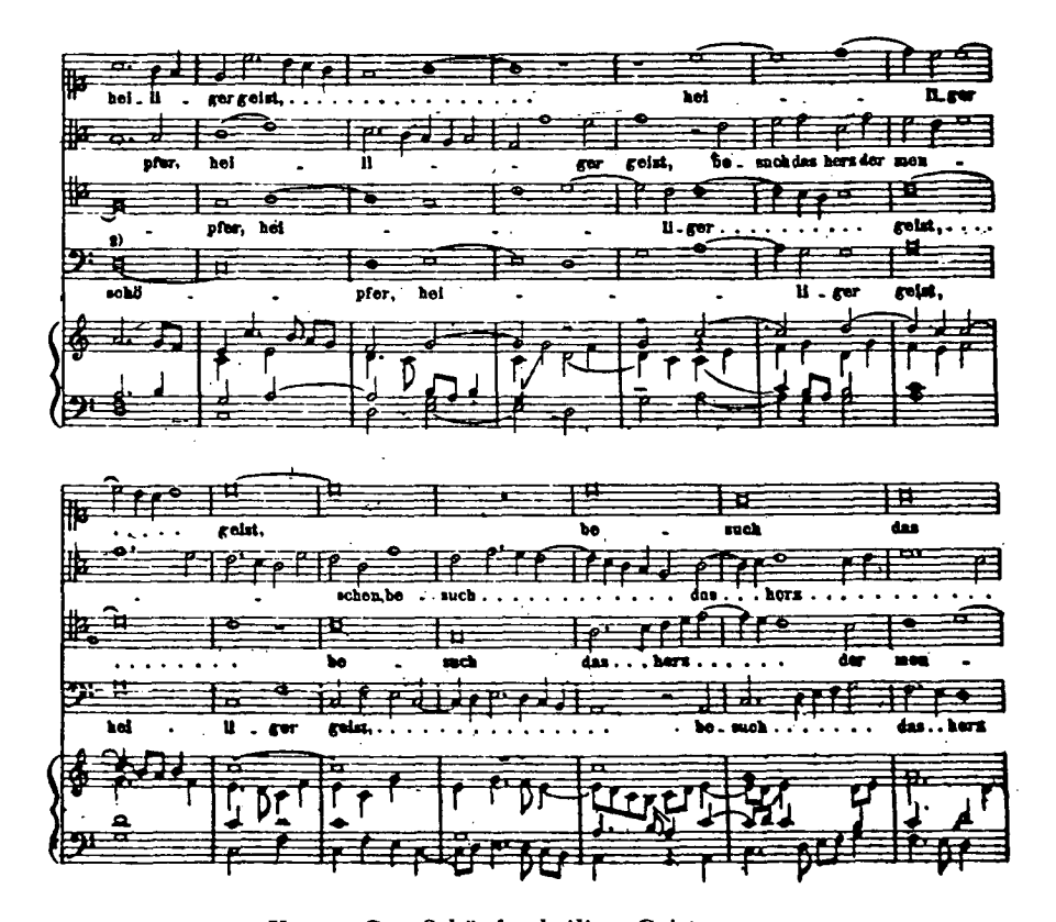
Komm, Gott Schöpfer, heiliger Geist

(The following is a poetic translation of the German text)